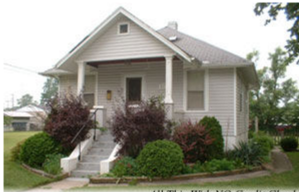
All This With NO Credit Check!